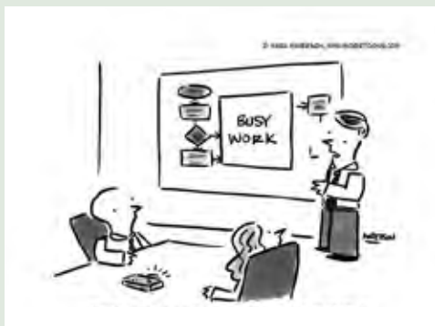
"Right away I can see a way to increase productivity."